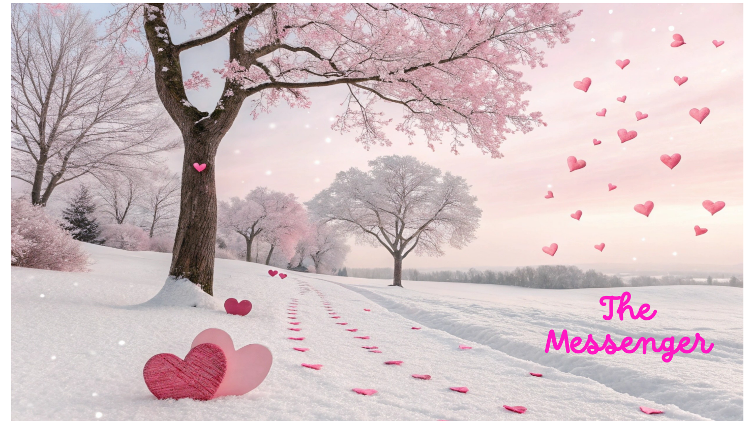
MONTHLY NEWSLETTER OF GROVE PARK BAPTIST CHURCH | FEBRUARY 2025

It may sound odd to you, but I find myself thinking about death often these days. Some may assign it to the rambling thoughts of a mind and body in the throes of middle age and I suppose that may be partially true. Yet, I cannot ascribe it solely to the continuous march of time. I think it has more to do with the fact that the continuous march of time has made me weary and fatigue has caused me to pause and ponder death from perspectives I haven't previously. More specifically, what issues cause me to needlessly expend energy trying to keep death at bay when the wisest course of action would be to allow time to have its say? I confess I waste tremendous energy and time attempting to breathe life into dreams that are now nothing more than idylls, traditions that have become antiquated, prescribed actions and habits that no longer match reality, and the list goes on. It occurs to me that I would be better served to just let these things pass in order, that I might be fully present and in the present.