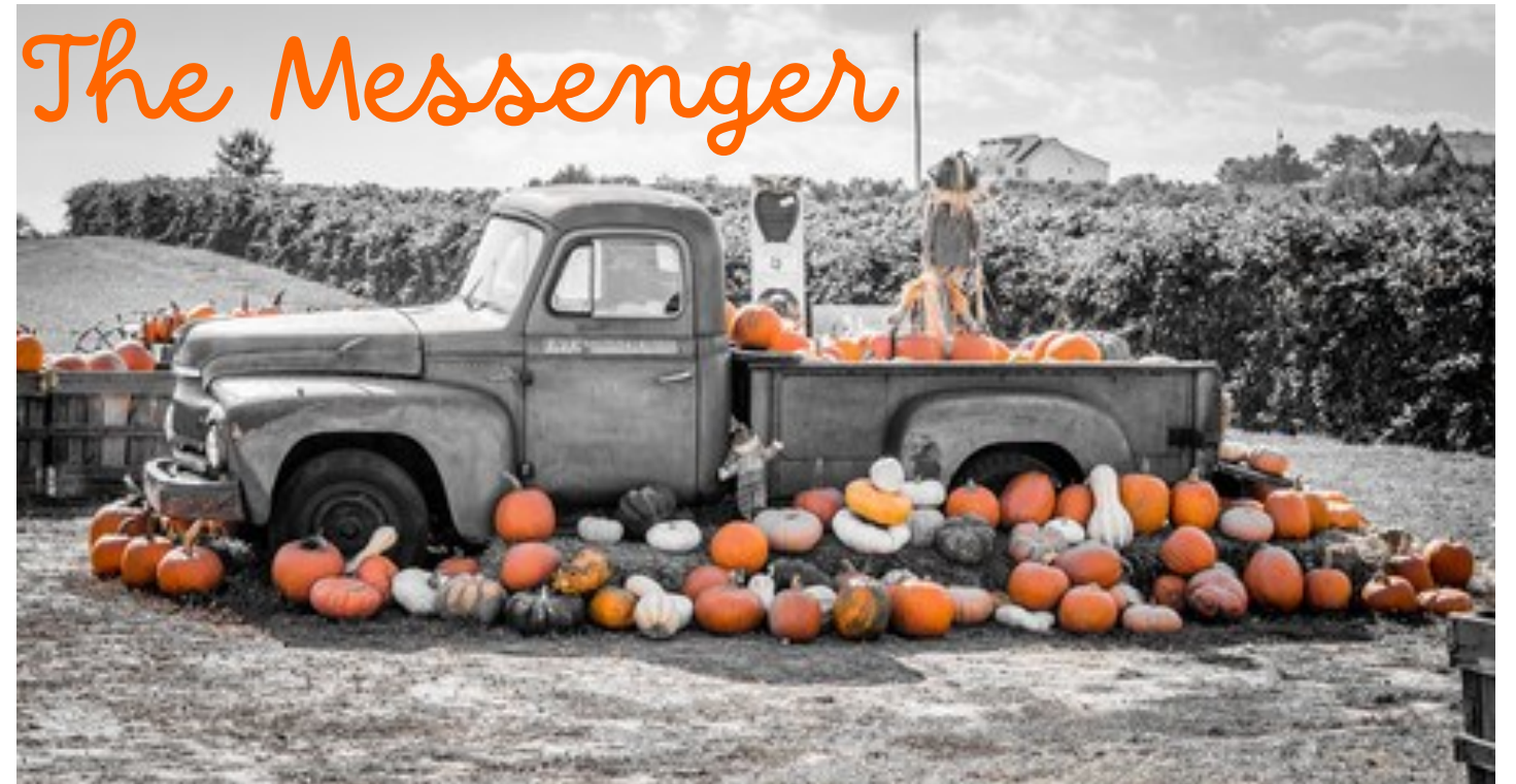
MONTHLY NEWSLETTER OF GROVE PARK BAPTIST CHURCH | OCTOBER 2024

It seems impossible to believe that 20 years ago this month I was preparing to move to Enfield and assume the pastorate at EBC on November 1. It feels so long ago and also so recent. I was so young, just 26, and had not a clue how dramatically different the future would unfold from what I imagined. I have found myself wanting desperately to tell that young kid a few things recently to make life a little easier for him in the years ahead. I thought I would take the opportunity to share some of that list with you as it might help you on your journey, for these revelations have certainly changed the trajectory of mine over these last 20 years.