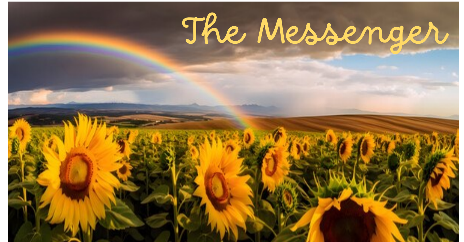
MONTHLY NEWSLETTER OF GROVE PARK BAPTIST CHURCH | SEPTEMBER 2024