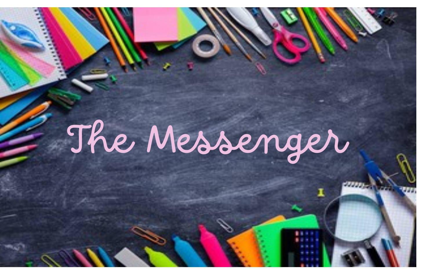
MONTHLY NEWSLETTER OF GROVE PARK BAPTIST CHURCH | AUGUST 2024

"Do you ever think about death?" It's a question that is often posed by a fictitious social media personality in response to some outrageous revelation in the news. I generally find it quite amusing when I read it, but recently after reading it I snuck down a different rabbit trail. I probably give more time to thinking about death than most folks because of the nature of my position being around those who are sick and facing death. Yet, I began to wonder if I properly acknowledge death as I should. For instance, is the outrage that I offer about death moving into things I cherish misplaced or warranted? I am often outraged and aflutter about issues that seem spiraling towards death, and for the sake of argument here I'll use ACC expansion in sports, that in the grand scheme of things truly do not matter. Please hear me, I am not saying that these are unimportant things. I am confident that anyone who grew up on Tobacco Road and listened to Thacker and Packer call games have multiple cherished memories. However, when viewed in light of the thousands of children every day across our world who are dying from malnourishment or gun violence and we are silent about it, are all outrages whether they be personal, ecclesial, cultural, or political match this level of importance?